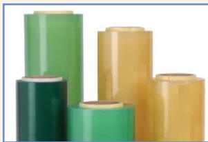
PVC STRECH FILM