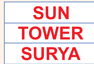
OUR OTHER BRANDS